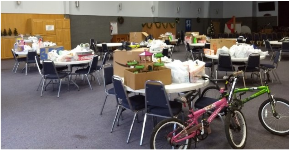
Each round table of donations shows you what each family received