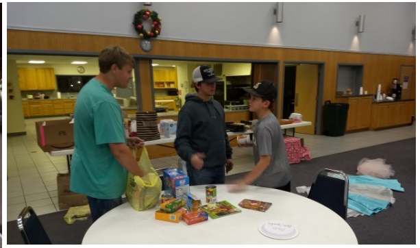
Youth sorting through donations